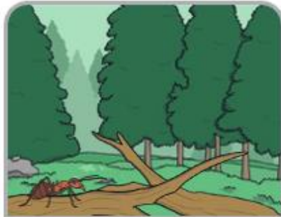
inside rotting wood